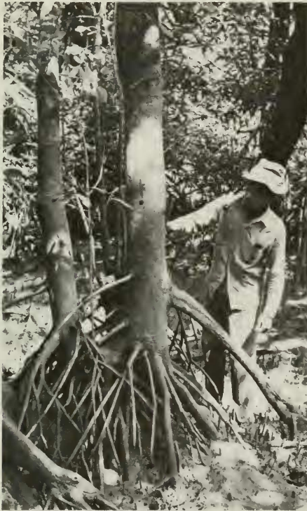
Fig. 3. Avicennia officinalis , showing prop-roots

lings of this species are uniform, and do not reveal any hybrid nature. Although the pollen-grains exhibit intermediate characters between A. alba and A. officinalis , they are mostly well-filled, rather than empty, thus suggesting that it is a distinct species [now known as A. marina (Forsk.) Vierh]."